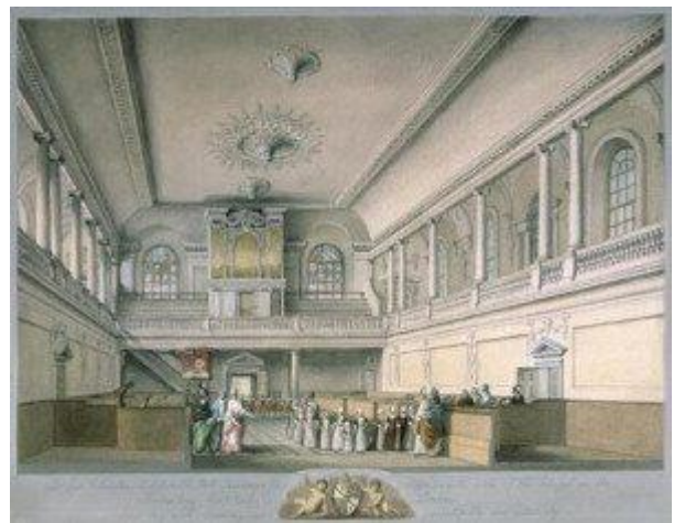
Foundling Hospital Chapel

Even in 1751, when the death of the Prince of Wales caused the closing of the theaters, Handel was permitted to give two performances of Messiah at the Foundling Hospital for another audience of 2,000. Both the chapel setting and the philanthropic purpose of these performances eased the minds of people discomforted by the performance of "a sacred oratorio" in a theater. Many shared the sentiments of socialite Catherine Talbot, who deemed Covent Garden "an unfit place for such a solemn performance" and extolled the virtues of the Foundling Hospital as a place "where the benevolent design and the attendance of the little boys and girls adds a peculiar beauty even unto this noblest composition."